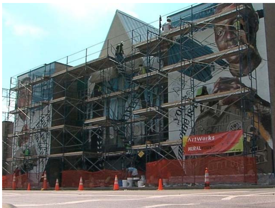
Copyright 2010 The E.W. Scripps Co. All rights reserved. This material may not be published, broadcast, rewritten, or redistributed.