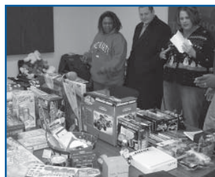
Program staff choose donated gifts for clients during the holidays.

Thanks to all who contributed to these efforts!