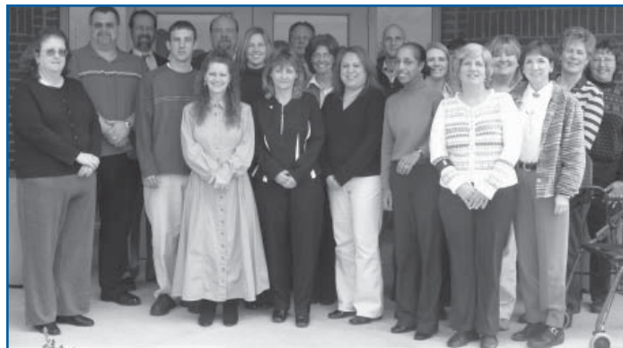
Brown County Recovery Services staff