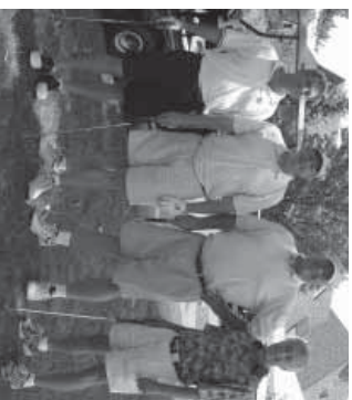
TITLE SPONSOR, THE STANDARD