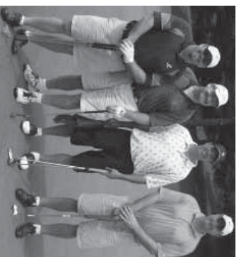
TITLE SPONSOR, COX FINANCIAL