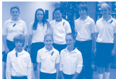
ST. URSULA VILLA STUDENTS

Students from St. Ursula Villa donated $85 to help Talbert House prevent drug use in the community.