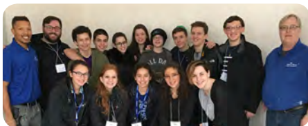
Central Region-United Synagogue Youth (CRUSY)