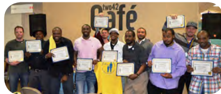
The Fatherhood Project Class 41 graduation held in March