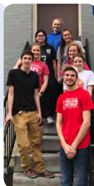
University of Cincinnati Dept. of Psychology