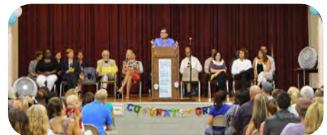
Hamilton County Drug Court graduation held in March