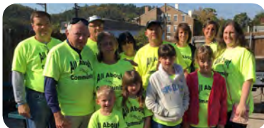
Mt. Orab Church of Christ