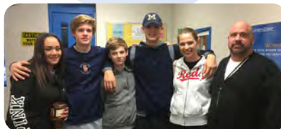
Comets for Community Service